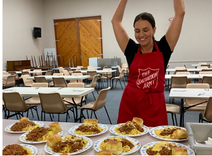
A Robert Half employee in our Perth, U.K., office after assembling meals for the Salvation Army.

Our employee-led volunteering had to go virtual in 2020. This kept us from volunteering side-by-side, but it allowed us to support a wider range of nonprofits.