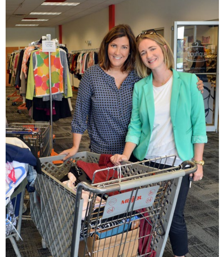
Robert Half directors from our Dayton, Ohio, office gather interview-appropriate attire for our nonprofit partner Dress For Success.

In lieu of holiday parties in 2020, we donated to food banks to help tackle hunger.