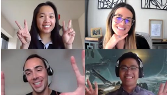
Robert Half employees say hello at the start of a virtual onboarding session.