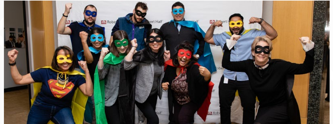
Robert Half employees at an employee recognition event.

We continue to build on what we are doing well and address opportunities to improve. One way we strive to do this is by bringing together what we call Culture Ambassadors. These are Robert Half employees who volunteer to assess the effectiveness of employee programs, make recommendations to management based on feedback from their colleagues and facilitate engagement. In January 2021, we expanded the program to include areas that drive our overall culture, including community relations, employee experience, recognition, and diversity, equity and inclusion (DEI).