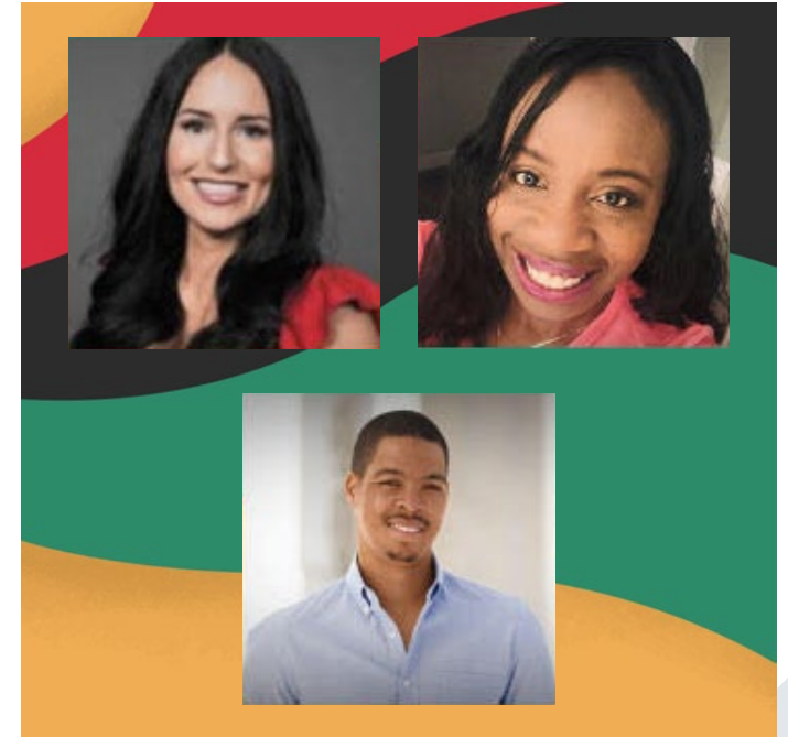
Members of our Black Employee Network Group meet to commemorate Juneteenth.

Protiviti's Racial Equity Advisory Council is composed of managing directors within Protiviti who provide advice to their executive team and outline potential next steps in Protiviti's journey toward racial equity and inclusiveness.