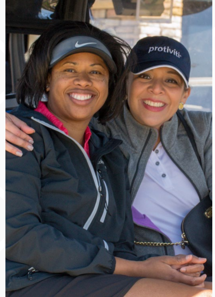
Protiviti employees in Atlanta at a charity golf tournament.

Robert Half's Corporate Grants Committee, made up of a diverse group of our employees, meets quarterly to review grant applications, prioritizing nonprofits that promote workforce development and education initiatives near our corporate services offices across North America. The committee also considers applications from employees who want to support a nonprofit they are involved with, even if the organization's focus is outside education and workforce development.