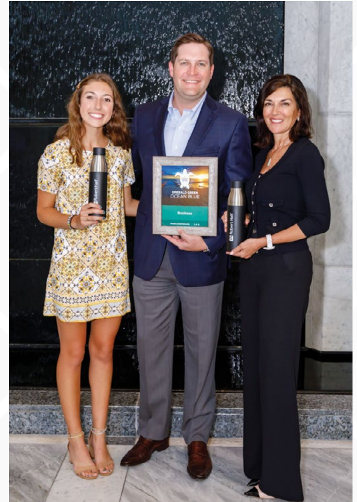
Robert Half executives (center and right) and an Emerald Keepers representative in La Jolla, Calif., support the Emerald Green, Ocean Blue pledge.

Our employees are crucial partners in implementing our corporate environmental programs and in helping our customers establish and set sustainability and ESG programs . We also encourage staff to support environmental causes and nonprofits in their communities, and Protiviti's Green Team program identifies office leads who are interested in organizing and measuring the impact of environmental initiatives.