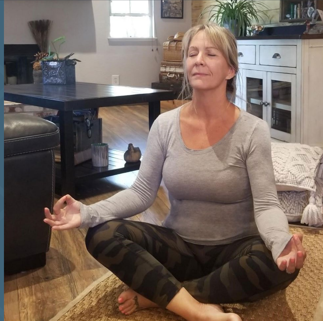
A Robert Half employee practices meditation at home as part of her wellness routine. ▶

Our EAP resources are available to all employees globally, with online counseling available 24 hours a day in North America. In 2020, our EAPs added 11,000 more therapists in the United States.