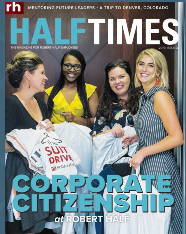
The fall 2019 cover of Half Times, Robert Half's employee magazine, features Robert Half employees in Dallas-Fort Worth gathering clothing items for the annual Suit Drive.