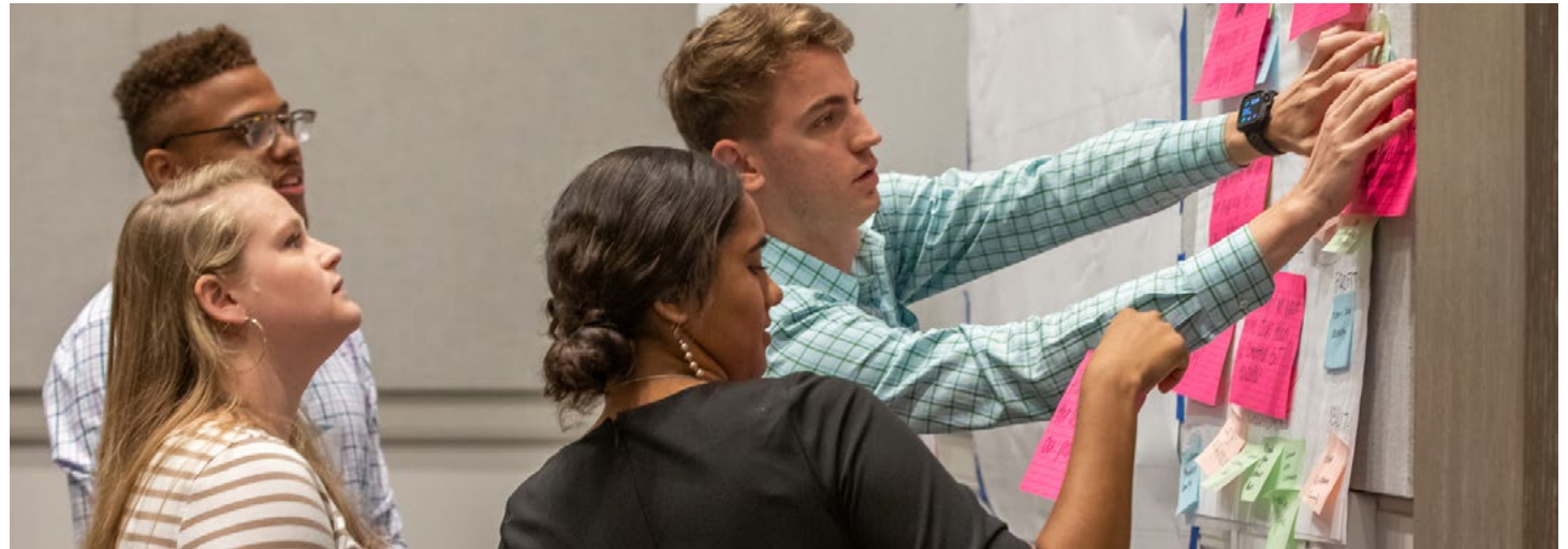
Protiviti employees collaborate at a Challenge training session in 2019.

Protiviti's LEAD Series focuses on leading oneself with integrity, leading others with inclusion and leading the business with innovation. Participants apply to participate in the program, which is offered to individuals in client service and operations roles. LEAD Series programs were postponed during the pandemic.