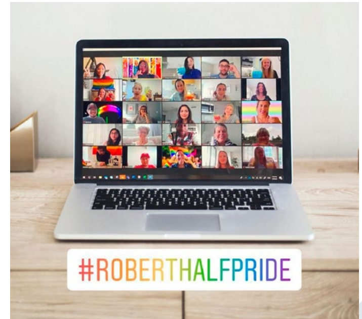
Robert Half employees in Toronto participate in a virtual Pride celebration in June 2020.

We participated in events led by our external DEI partners to help our recruiters expand their talent pools, and we further incorporated DEI into our community programs.