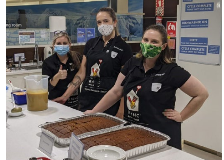
In Auckland, New Zealand, Robert Half employees volunteer at a Ronald McDonald House, a charity that provides free housing to families caring for their hospitalized children.