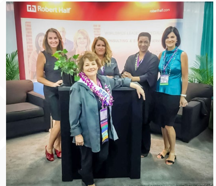
Robert Half professionals gather at the Women's Business Enterprise National Council (WBENC) trade show.

We also strongly encourage our community alliances and suppliers to work with diverse suppliers themselves.