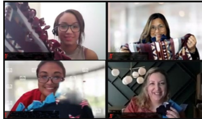
Robert Half employees participated in a virtual volunteer event with HandsOn Bay Area, creating no-sew blankets to be donated to a local nonprofit organization.