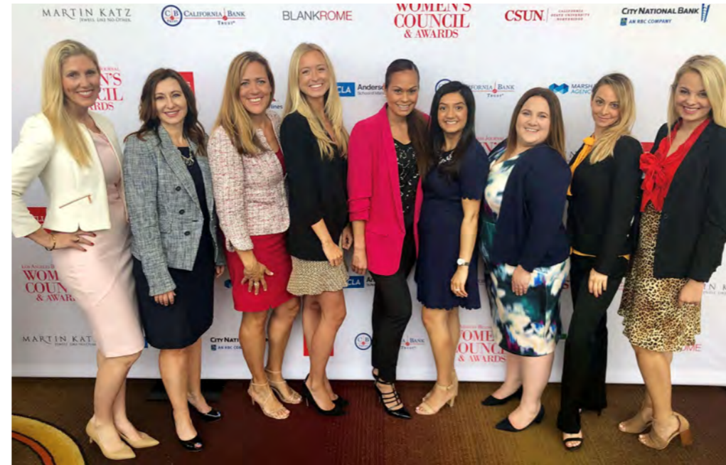
Professional Staffing Services team members at the Los Angeles Business Journal Women’s Council & Awards

Robert Half recognized International Women’s Day in March 2019 with the employee webinar Balance: Work, Life, Moving Ahead. The panelists — three of our executives who had been named to Staffing Industry Analysts’ 2018 Global Power 150: Women in Staffing — shared stories from their professional and personal lives. More than 1,100 employees participated.