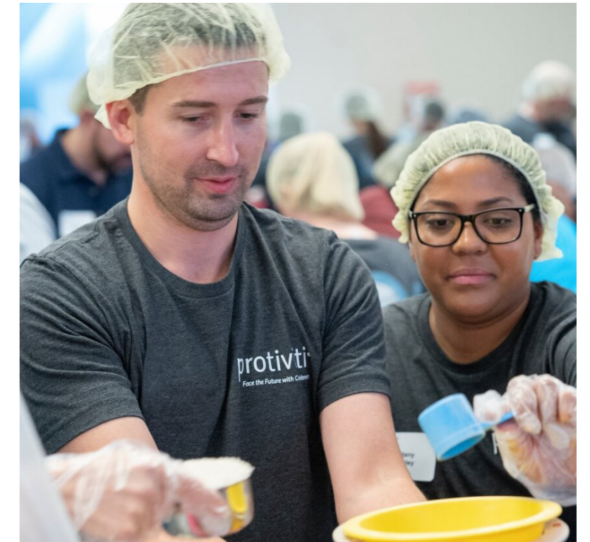
Protiviti professionals from Washington, D.C., and Virginia at an i on Hunger event