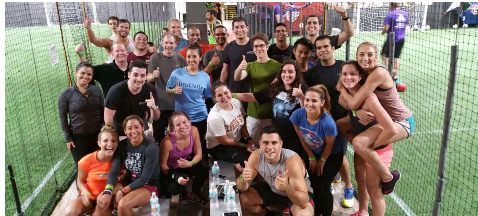
Protiviti's Fort Lauderdale team members at their competitive bubble soccer match

Protiviti also works to empower and engage women in our workforce through networking events, conferences and awards; Women in Leadership panels, hosted internally and externally; leadership pipeline discussions during each promotion cycle; and activities and educational sessions sponsored by the Protiviti network group iGROWW (Initiative for Growth and Retention of Women at Work). iGROWW includes a subgroup, GET IT, that focuses on gender equality in information technology (IT).