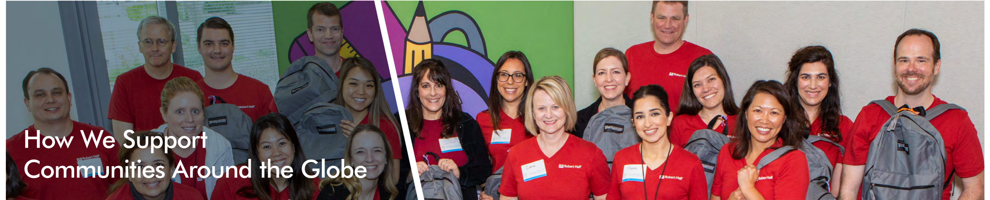
Corporate Services employees in San Ramon after filling backpacks for students during a Week of Service volunteer event