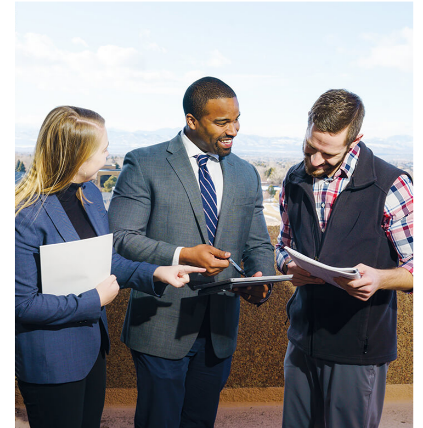
Robert Half Legal and OfficeTeam staffing professionals in Denver