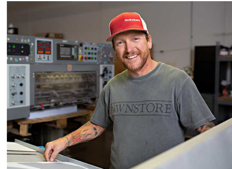
A team member at the Robert Half Printing facility in Ankeny, Iowa

Our teams rely on an array of technology to support their business needs. As equipment — including computers, tablets and mobile phones — is phased out, whenever possible, we donate items to nonprofit organizations that can benefit from the technology. In the United States, we work with an electronic-waste specialist to break down equipment responsibly and recycle the components. U.S. offices of Robert Half and Protiviti diverted 21,872 pounds of e-waste, including computers, monitors and cables, from landfills in 2018.