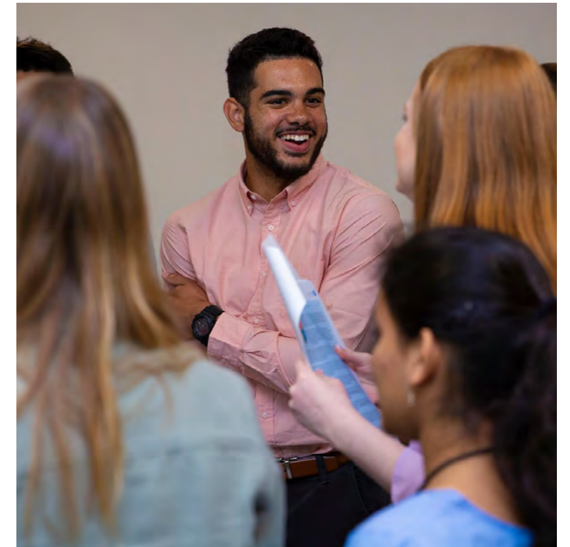
Robert Half summer interns at the main Corporate Services campus in San Ramon