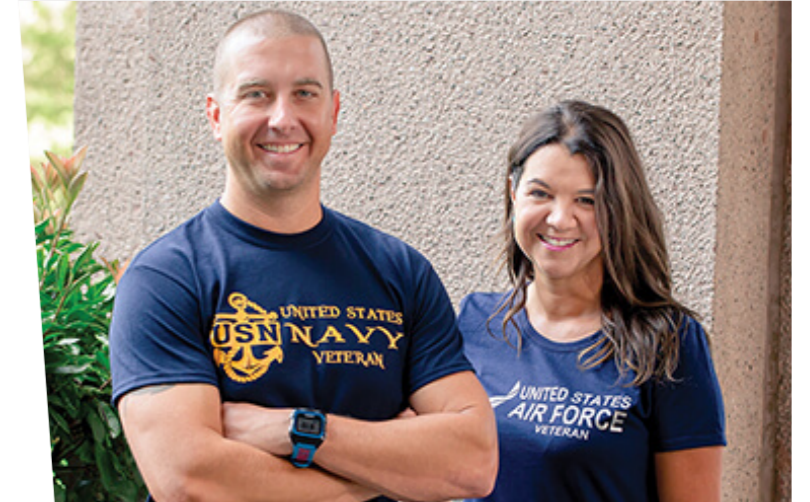
Robert Half Technology staffing professionals, both U.S. military veterans, at our Albuquerque, N.M., office