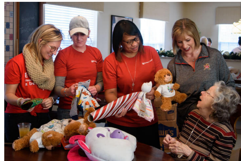
Robert Half staffing professionals at a Holiday Giving event in Lexington, Ky.

Teams from 75 offices collected more than 10,000 toys and games in 2018, bringing our total to more than 140,000 since the program’s launch.