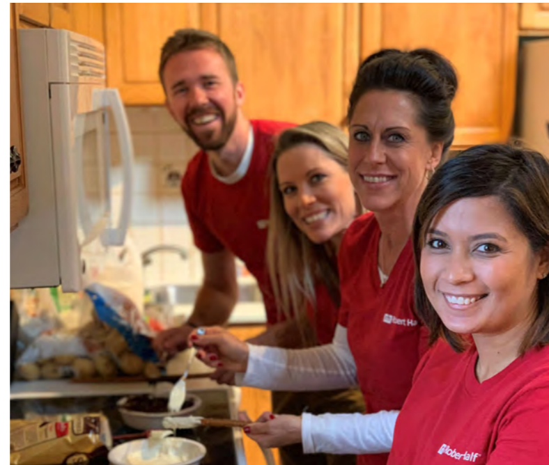
Robert Half team members in Grand Rapids, Mich., making cookies at a volunteer event