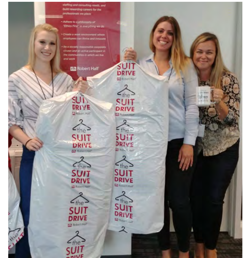
Robert Half staffing employees at the annual Suit Drive in Burlington, Ontario

Our Suit Drive had a record-breaking year in 2018: We collected 42,100 items — including suits, dresses, shoes and accessories — across 110 field offices and four Corporate Services locations. Since 2002, we have collected 363,500 items for job seekers who request assistance from our partner organizations.