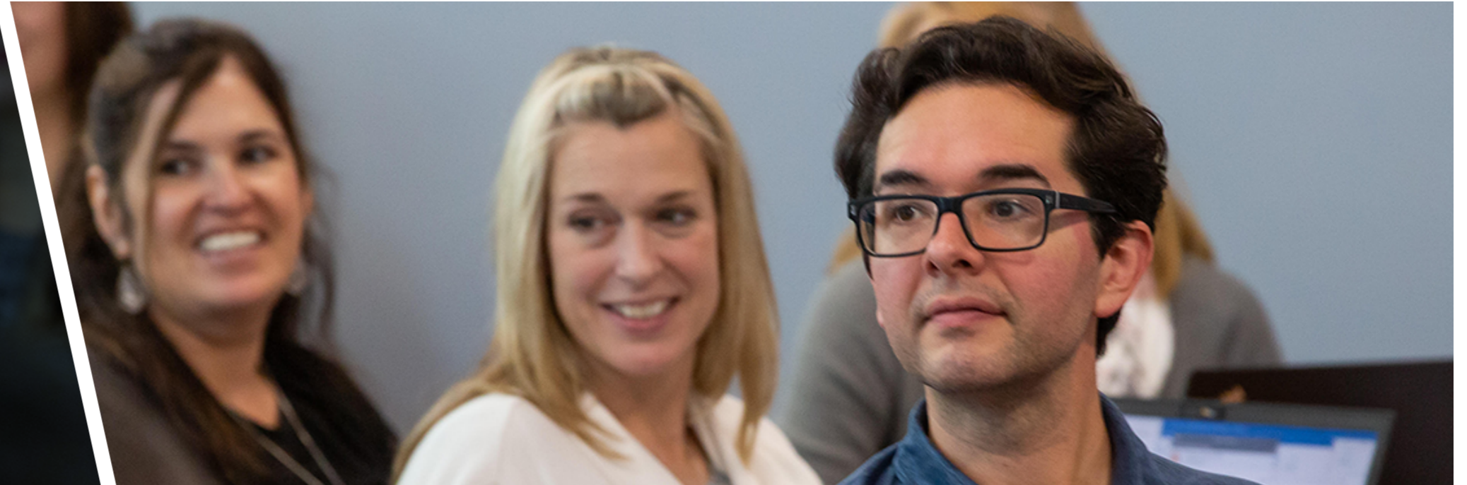
Robert Half employees at our main Corporate Services campus in San Ramon, Calif.