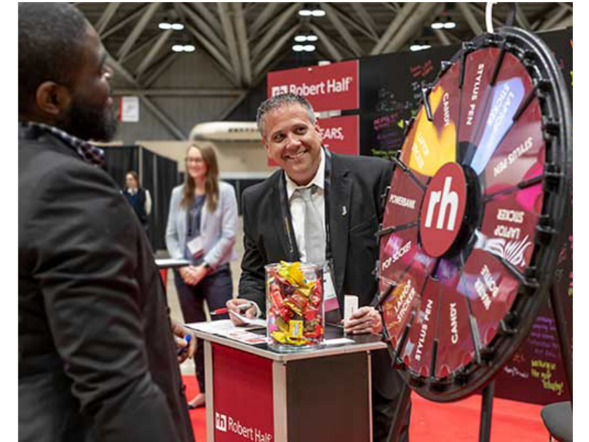
An Accountemps staffing professional and a student participant at the Enactus U.S. National Exposition in Kansas City, Mo.

In 2018, Robert Half was a corporate sponsor of the Enactus World Cup , held in San Jose, Calif. The event brought together 35 Enactus teams from around the world to compete. Our company served as a sponsor of the 2019 Enactus World Cup.