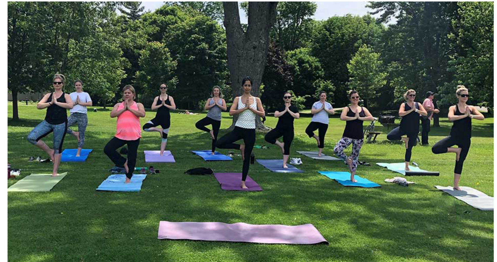
Employees at a Wellness Wednesdays event in Waterloo, Ontario

Robert Half also offers qualified U.S. temporary professionals and their dependents access to various benefit options, including medical, dental and vision plans; life insurance; and accident coverage.