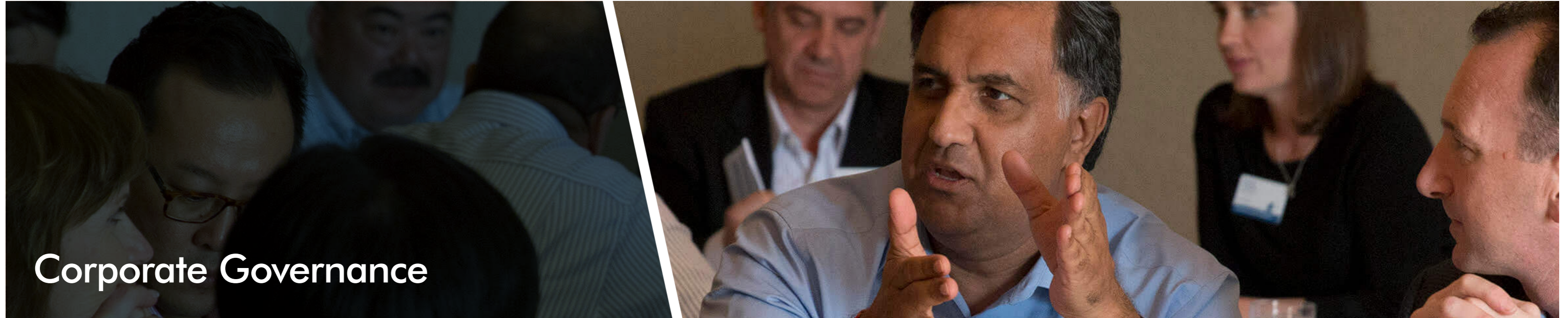
Robert Half and Protiviti professionals at a company meeting in Carlsbad, Calif.