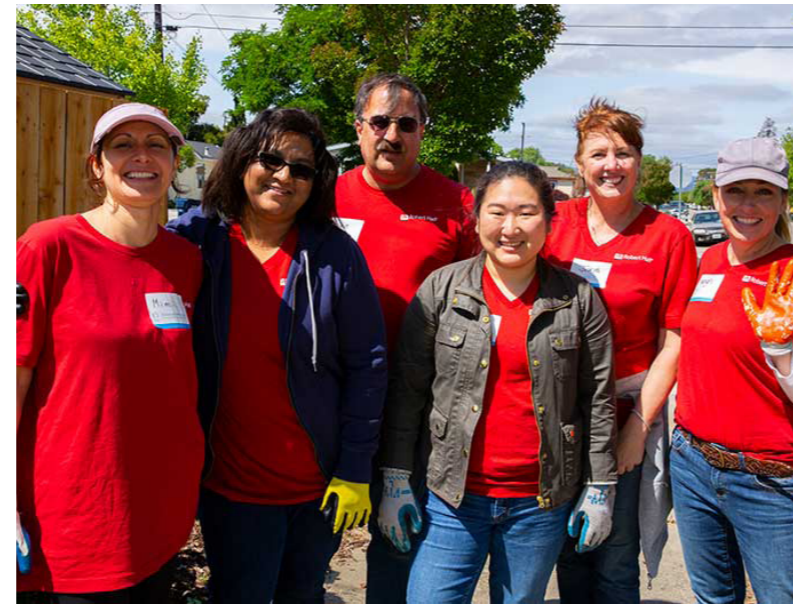
Operational Support Technology team members from Robert Half's San Ramon main campus at a Week of Service volunteer event

Robert Half was a sponsor of the JA S.H.E. (Strengthen Her Education) Leads STEM Summit held in San Ramon and Richmond, Calif., in 2018 and 2019, respectively. JA S.H.E. Leads connects local businesswomen and outstanding female high school students from the San Francisco East Bay Area in a day of STEM