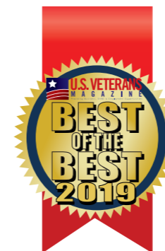
Robert Half was named to the list of “Best of the Best Top Veteran-Friendly Companies” by U.S. Veterans Magazine (2014-2019).