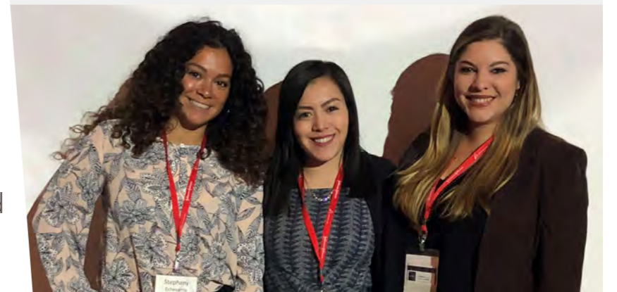
Protiviti consultants attend an ALPFA (Association of Latino Professionals For America) conference